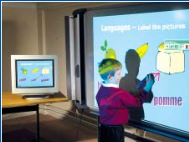
CleverBOARD helps to develop learning throughout Key Stages 1-5