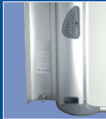
CleverBOARD's control panel

CleverBOARD's unique locking system allows you to safely store all your accessories, including the serial cable. A universal key is used to access the CleverBOARD, so multiple or individual keys are not required.