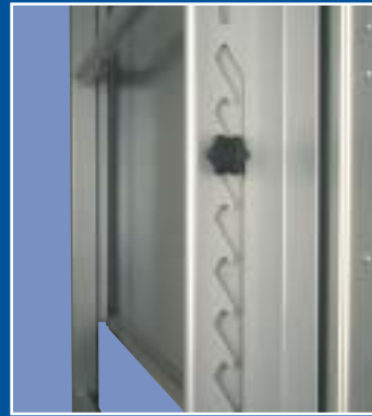
Height adjustment is quick and easy

Whiteboards have become familiar in Education over the past few years. The BIG challenge has been to get lesson notes from the board to the pupils quickly, easily and efficiently - that's where CleverBOARD is indispensable in the classroom!