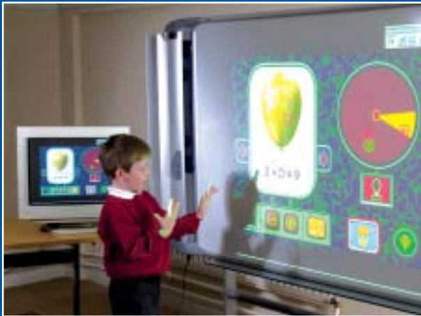
CleverBOARD in touch screen mode

CleverBoard includes everything you need for brilliantly captured notes:-